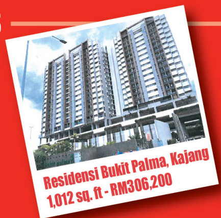
Residensi Bukit Palma, Kajang 1,012 sq. ft - RM306,200

PROSPECTIVE BIDDERS MAY SUBMIT THEIR BIDS FOR THE PROPERTY ONLINE