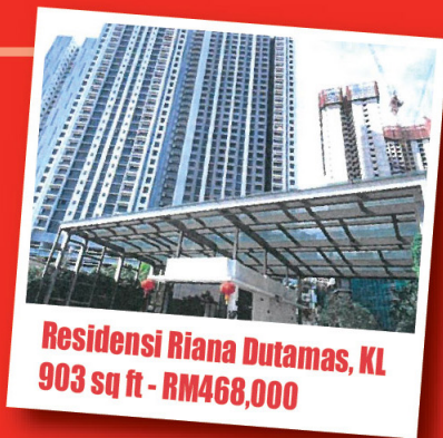
Residensi Riana Dutamas, KL 903 sq ft - RM468,000